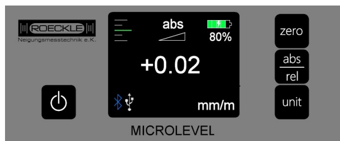
Colorgraphic display with clearly arranged and logical operating functions

...further information is available at www.roeckle.com